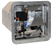
(12v Ignition/ 240v Element)