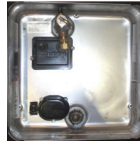
(240v Element Only)