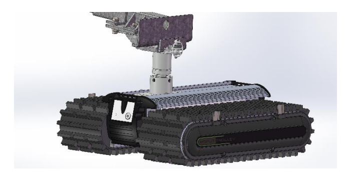
Illustration of the Robot Trolley mounted on the side members of the caravan:

VARIANTS RT4500 and RT2500RS models are equipped with low tower with ball joint Low tower for RT4500 and RT2500RS