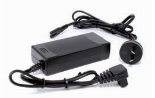
AC Power Adaptor

NOTE: Both Anderson Plugs are setup with live DC voltage always at the socket. You can have solar going in one end & another fridge running off the opposite end Anderson plug at the same time