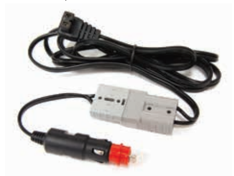
DC Power Cable

(Can be Cigarette connection or Merit connection by removing/replacing red twist cap or Anderson plug connection by seperating the two anderson plug (Fig.4)