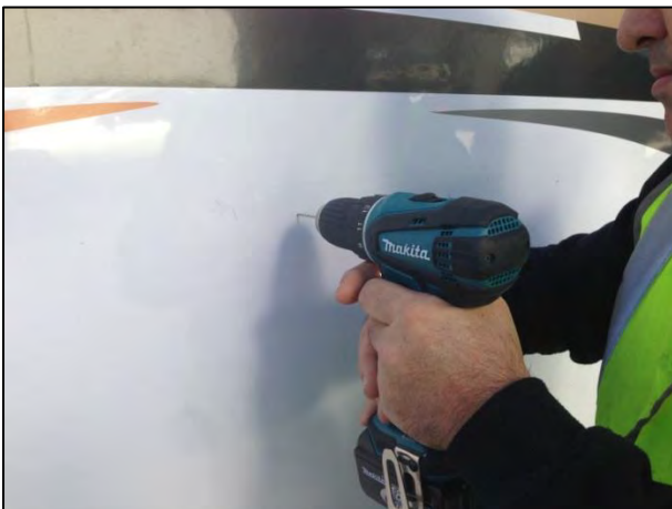
Figure 1 LED Power Loom Access Hole Location (Not to scale)

Note: The pilot holes' size will depend on the material that your vehicle is manufactured from (eg: aluminium cladding, steel cladding, fibreglass, aluminium diamond plate). Each of these materials will require a different size pilot hole for the screws provided in this kit, and in some cases the screws will not be suitable and rivets will have to be used. Rivets are not supplied in this kit. Drill the pilot holes that were marked with pencil, taking care not to drill right through the wall (don't forget your vehicle might have very thin walls).